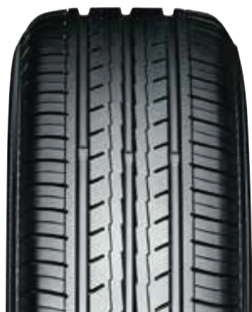
ES32 standard design WIDTH: 145 -215

Optimised tread design adopted for each size width