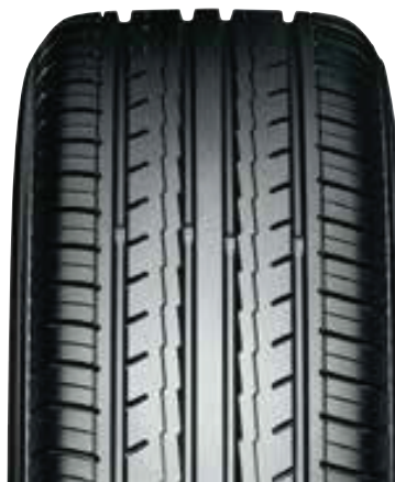
ES32A wide-design WIDTH: 225 and more

The All New Powerful And Comfortable Tread Design