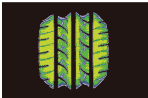
Current standard tyre AE01

Contact pressure homogenization and improvement of uneven wear.